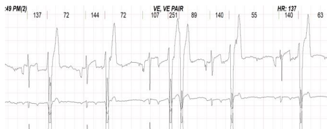
Couplet with bigeminy

The information and recommendations provided are based on the images presented by the referring veterinarian. No evaluation can be communicated regarding pathology that was not visible in the image/video clips provided.